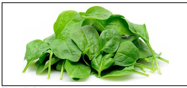
Figure 2: Spinach leaves.

It is an important leafy vegetable, considered to have a high nutritional value, including antioxidants, vitamins, minerals and secondary metabolites. Spinach (Figure 2) has enormous genetic diversity, among which might be high-folate germplasm. It might be worth identifying the spinach germplasm with elevated amounts of folate, could be used as a variety without any modification or as a source of genes to introgress into crop species. It contains high amount of folate.