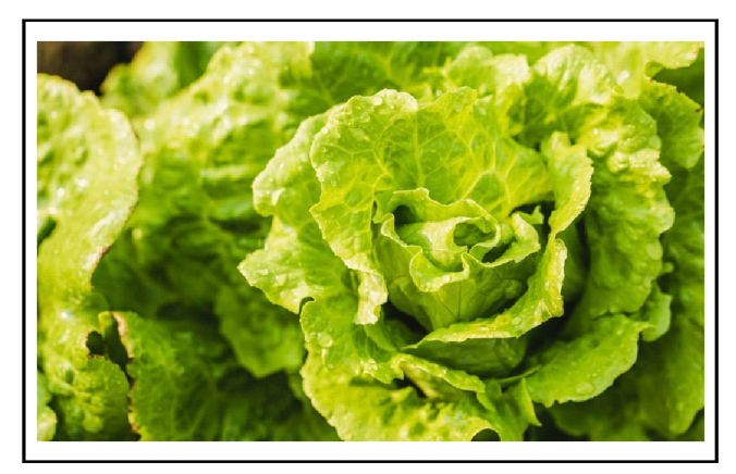
Figure 3: Lettuce plant.

Folate content expressed in folic acid equivalents, in the lettuce samples varied six-fold, from 30 to 198 \mu g 100 g<sup>-1</sup> on a fresh weight basis (Johansson et al. , 2007). A group of researchers from the Brazilian Agricultural Research Corporation (EMBRAPA) and the University of Brasilia developed several lettuce lines accumulating high levels of folate. The lettuce plants (Figure 3) express a synthetic gchI gene, based on a native chicken gene, which encodes an enzyme that plays a central role in the folate biosynthetic pathway. The GM lettuce lines contain 2-8 times higher folate levels than the non-transgenic lines. According to the researchers, the folate content in enriched lettuce would provide 26% of the dietary reference intake (DRI) for an adult, in a regular serving (Nunes et al. , 2009).